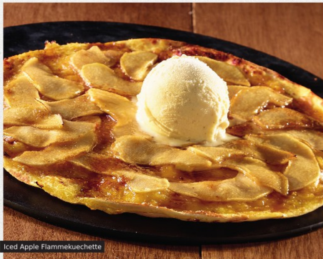
Iced Apple Flammekuechette