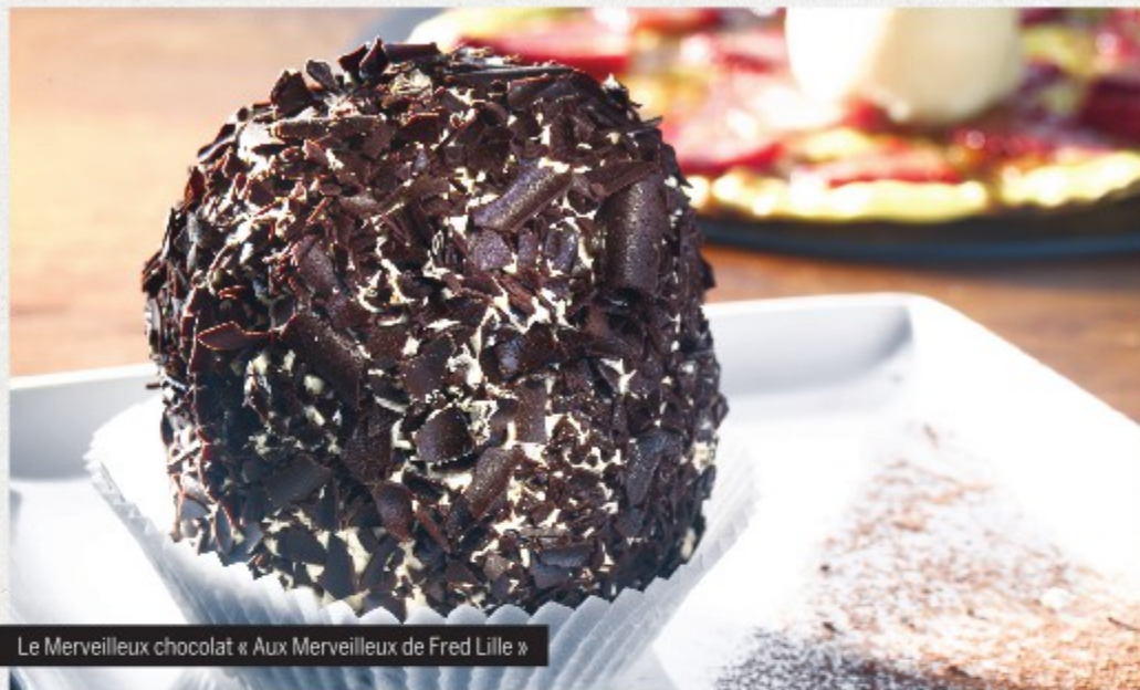
Le Merveilleux chocolat « Aux Merveilleux de Fred Lille »