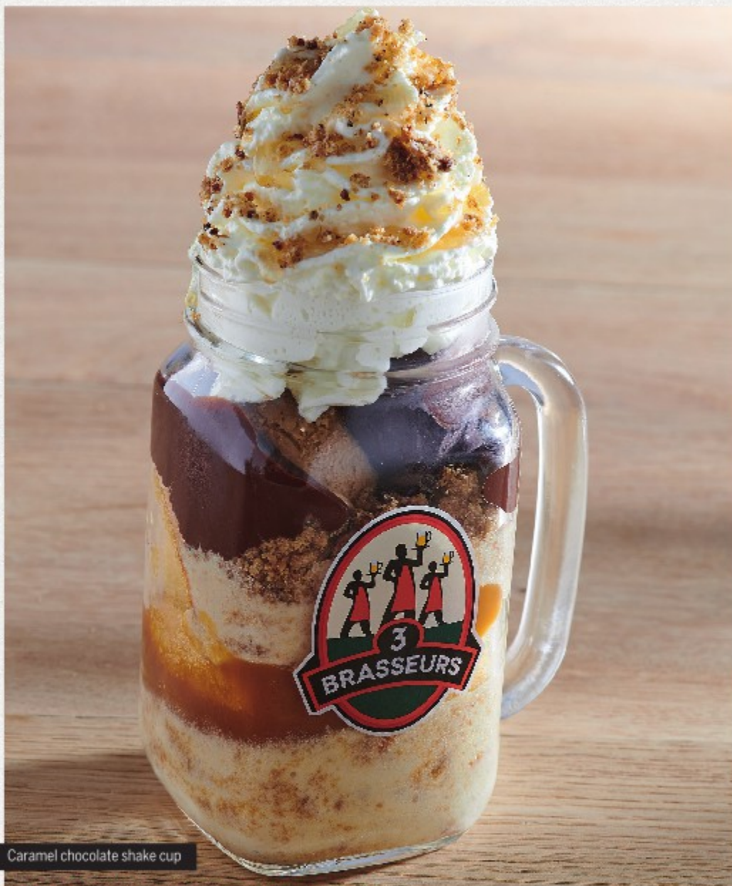
Caramel chocolate shake cup